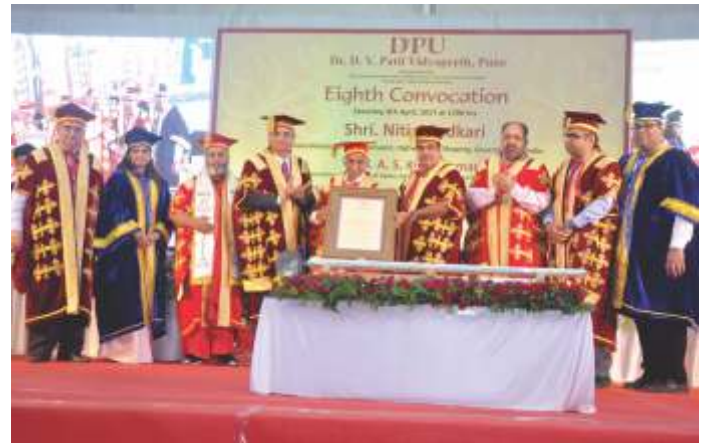
Conferring the degree of Doctor of Science ( Honoris Causa ) on Shri. A. S. Kiran Kumar , Secretary, Department of Space, Government of India and Chairman (ISRO)