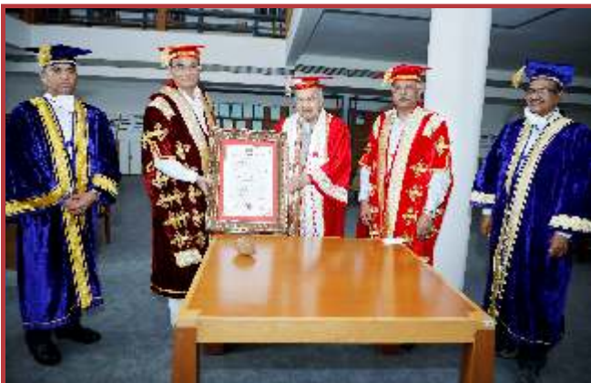
Conferring the Degree of Doctor of Science ( Honoris Causa ) on Hon'ble Dr. Jayant Narlikar Emeritus Professor, (IUCAA)