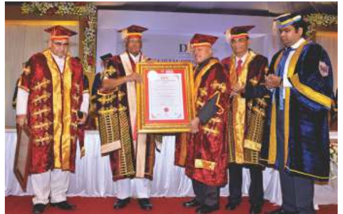
Conferring the degree of Doctor of Science ( Honoris Causa ) on Prof. M. S. Swaminathan , Eminent Agricultural Scientist