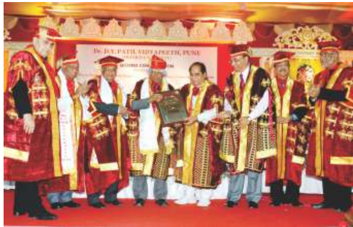
Felicitation of Chief Guest Dr. A. P. J. Abdul Kalam , Former President of India