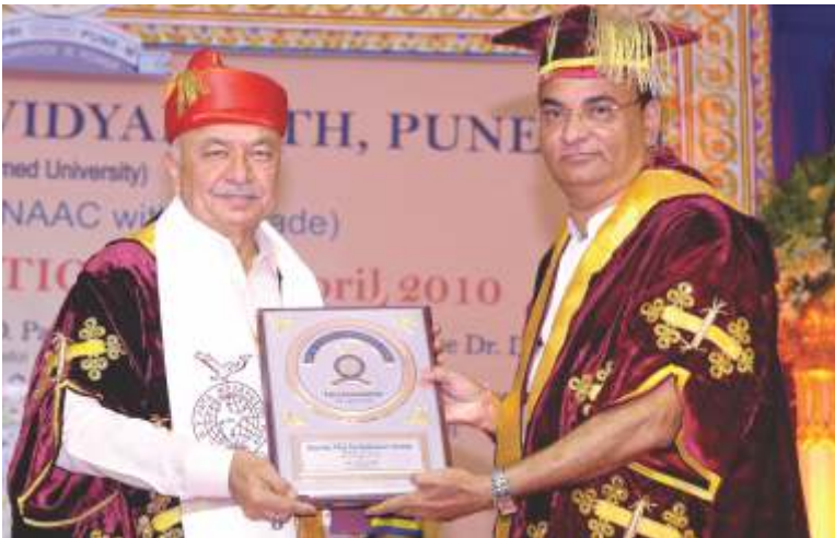
Felicitation of Chief Guest Shri. Sushilkumar Shinde The then Union Minister of Power, Government of India