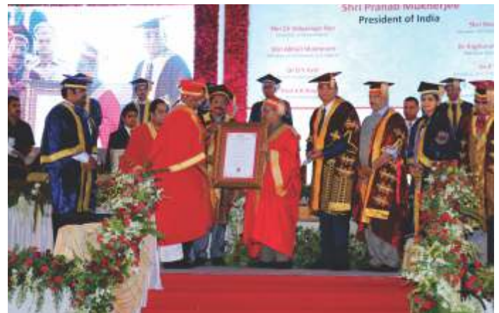
Conferring the degree of Doctor of Letters ( Honoris Causa ) on Shri. Sharad Pawar, Member of Parliament (Rajya Sabha)