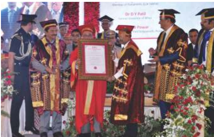
Conferring the degree of Doctor of Science ( Honoris Causa ) on Shri. Abhijit Mukherjee Member of Parliament (Lok Sabha)