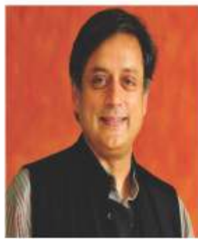
Dr. Shashi Tharoor ( Member of Parliament, Writer and former International diplomat)