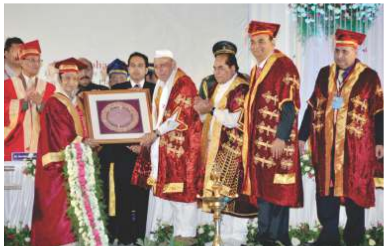
Conferring the degree of Doctor of Letters ( Honoris Causa ) on Shri. Montek Singh Ahluwalia, Deputy Chairman, Planning Commission, Government of India