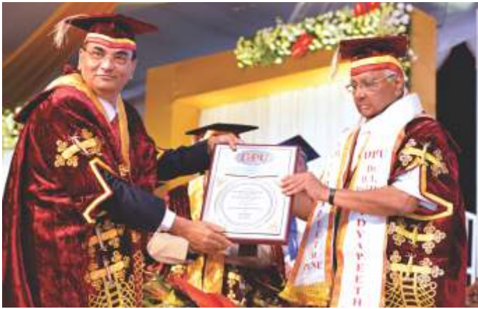
Felicitation of Chief Guest Shri. Sharadchandra Pawar , The then Union Minister of Agriculture & Food Processing Industry, Government of India