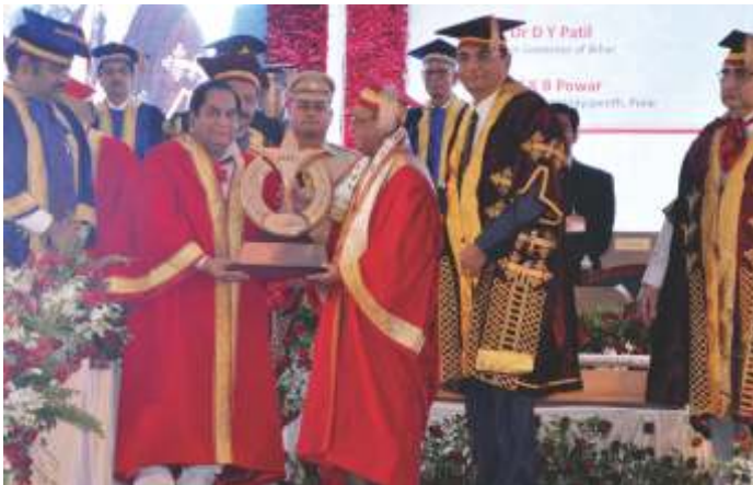
Felicitation of Chief Guest Hon'ble Shri. Pranab Mukherjee, President of India