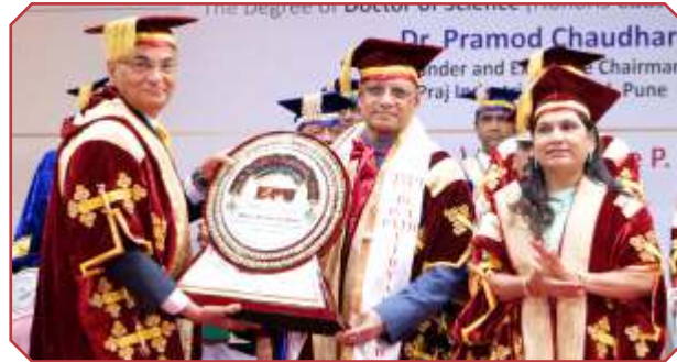
Felicitation of Chief Guest Shri Ramesh Bais Hon'ble Governor of Maharashtra