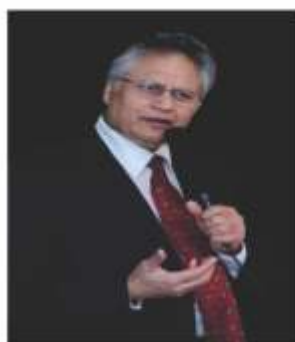
Mr. Shiv Khera (Author- You Can Win, Motivational Speaker, Educator, Business Consultant)