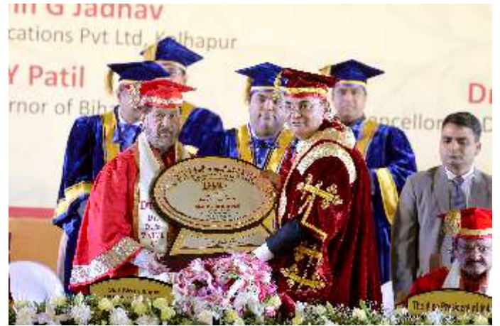
Felicitation of Shri. Girish Bapat Hon'ble Guardian Minister, Pune