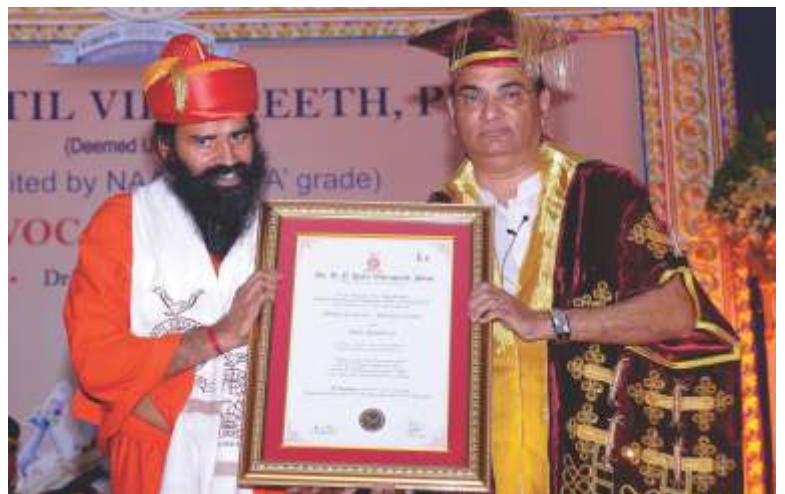
Conferring the degree of Doctor of Science ( Honoris Causa ) on Baba Ramdev ji Founder Patanjali Yogpeeth, Haridwar