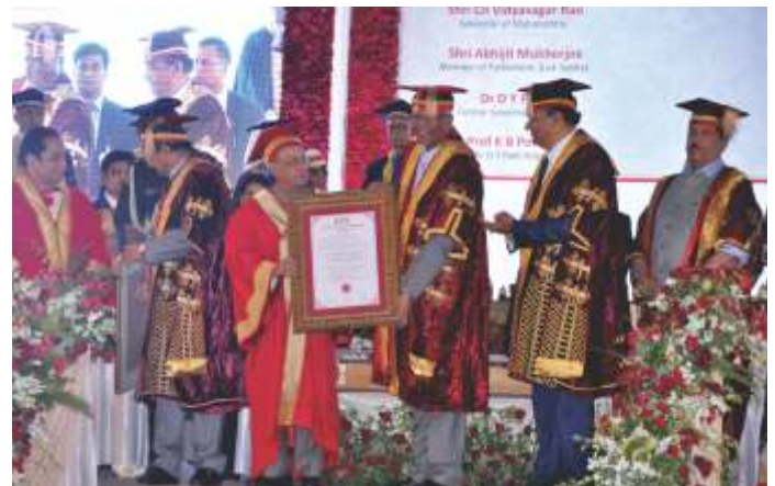
Conferring the degree of Doctor of Science ( Honoris Causa ) on Dr. Raghunath Mashelkar National Research Professor