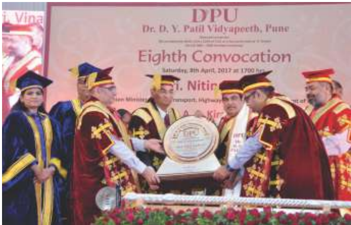
Felicitation of Chief Guest Shri. Nitin Gadkari , Union Minister of Road Transport, Highways and Shipping, Government of India