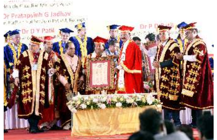
Doctor of Science degree ( Honoris Causa ) conferred on Prof. Achyuta Samanta Founder, KIIT and KISS, Bhubaneswar Member of Parliament (Rajya Sabha)