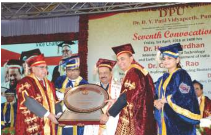
Felicitation of Chief Guest Dr. Harsh Vardhan, Minister of Science and Technology and Earth Sciences Government of India