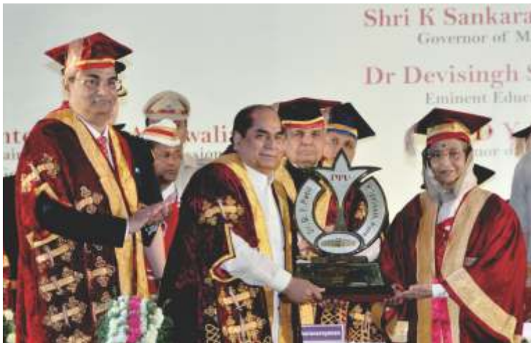
Felicitation of Chief Guest Smt. Pratibha Devisingh Patil, President of India