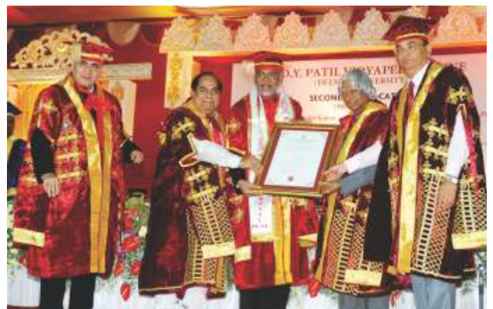
Conferring the degree of Doctor of Letters ( Honoris Causa ) on Dr. Narendra Jadhav , Member, Planning Commission, Government of India