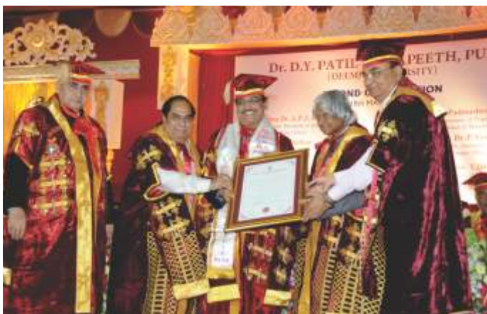
Conferring the degree of Doctor of Letters ( Honoris Causa ) on Advocate Ujjwal Nikam , Special Public Prosecutor, Government of Maharashtra