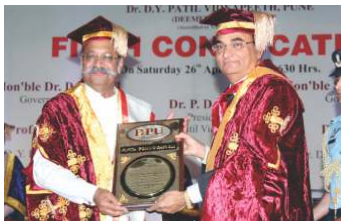
Felicitation of Chief Guest Hon'ble Shri. Shrinivas Patil Governor of Sikkim, India