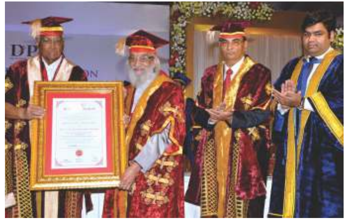
Conferring the degree of Doctor of Letters ( Honoris Causa ) on Shri. B. M. alias Babasaheb Purandare , Eminent Historian and play-writer