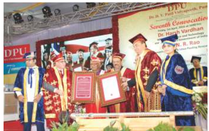
Conferring the degree of Doctor of Science ( Honoris Causa ) on Dr. C. N. R. Rao, National Research Professor & Linus Pauling Research Professor