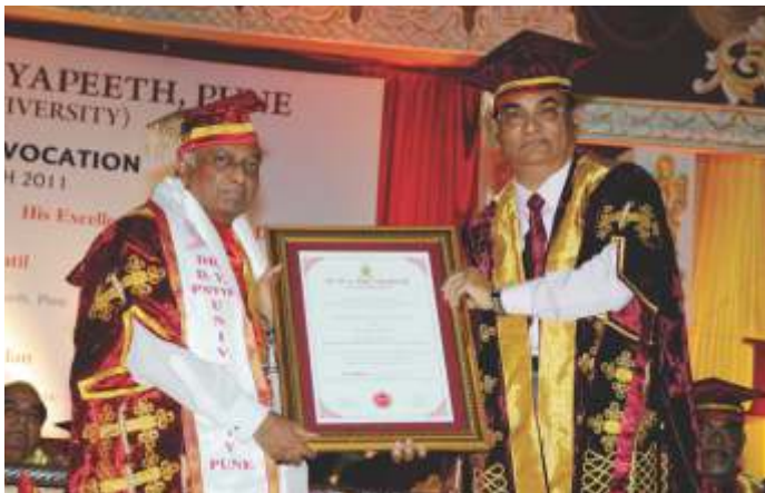
Conferring the degree of Doctor of Science ( Honoris Causa ) on Dr. Vijay Bhatkar , Chairman, ETH Ltd. and former Director CDAC