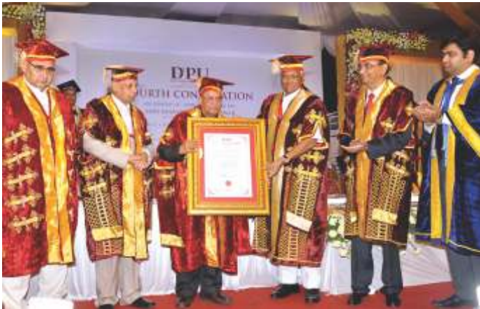
Conferring the degree of Doctor of Science ( Honoris Causa ) on Dr. Krishnaswamy Kasturirangan , an Architect of India's Space Research Programme