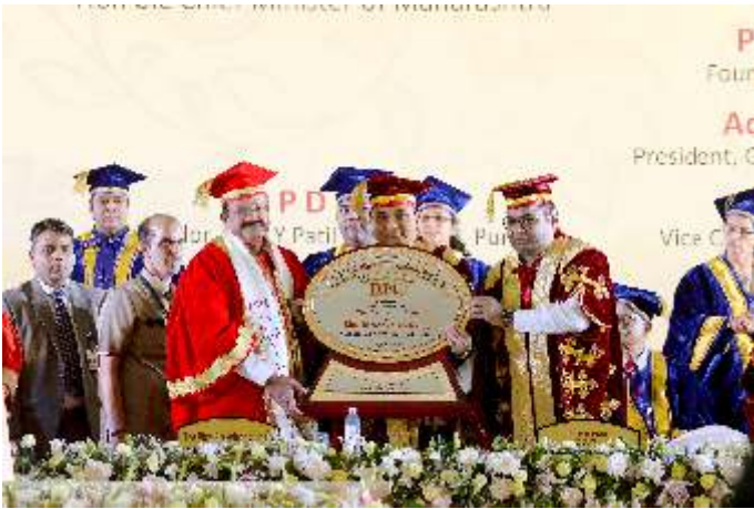
Felicitation of Chief Guest Shri. M. Venkaiah Naidu, Hon'ble Vice President of India