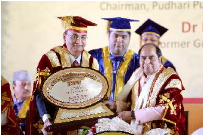
Felicitation of Dr. D. Y. Patil Former Governor of Bihar