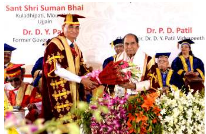
Felicitation of Dr. D. Y. Patil Former Governor of Bihar