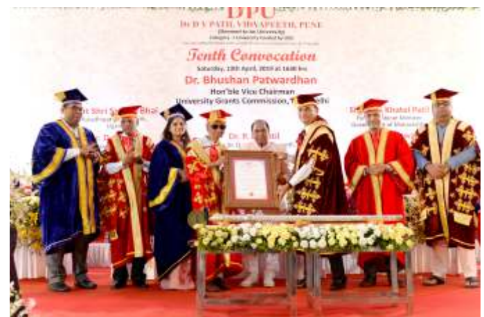
Doctor of Letters degree ( Honoris Causa ) conferred on Shri B. J. Khatal Patil Former Cabinet Minister, Government of Maharashtra