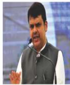
Mr. Devendra Fadnavis Hon'ble Deputy Chief Minister of Maharashtra