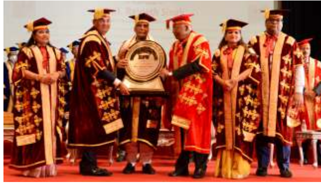
Felicitation of Chief Guest Shri. Rajnath Singh Defence Minister, Government of India